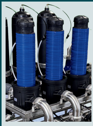
Stacked Turbo Disc Filters